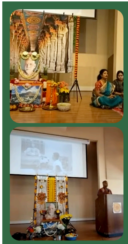
Washington DC Satsang Jayanthi and Aradhana Celebration