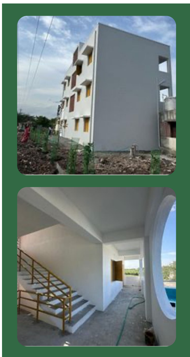
Thiruchuzhi school building in construction

The Sethupathi School in Tiruchuzhi, Tamilnadu, where Bhagavan studied in his early days, required extensive repairs and additional restrooms for the children. The Ashram has undertaken a project to expand the school buildings with new construction. The work is progressing well and is expected to be completed by the end of 2024. The school authorities, teachers, and children are deeply grateful for this noble effort.