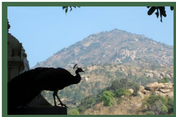
A silhouette of a peacock at the ashram with Arunachala Hill in the background