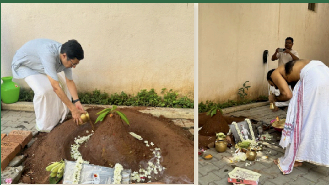
Bhumi Puja for Achalam Building Expansion

About ten years ago, the Achalam Guest House near the President's compound was inaugurated with 21 new, spacious rooms. Now, a major expansion is underway on the adjacent property, which will add approximately 52 new rooms and an additional floor, bringing the total number of rooms available for Ashram staff and guests to 73. On May 13th, a Bhumi Puja for the extension was performed in the Achalam garden, presided over by the Ashram President, with devotees in attendance.