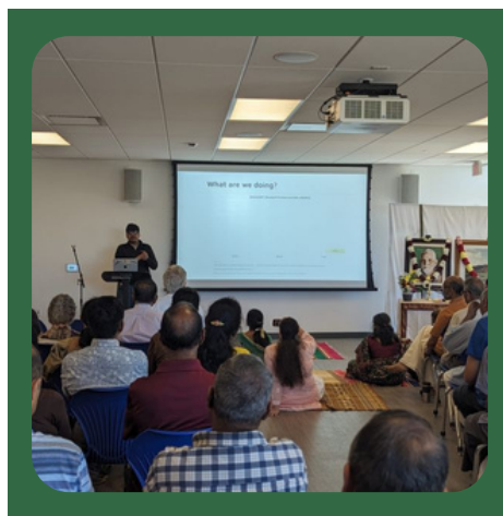
San Francisco Bay Area Aradhana day AI talk