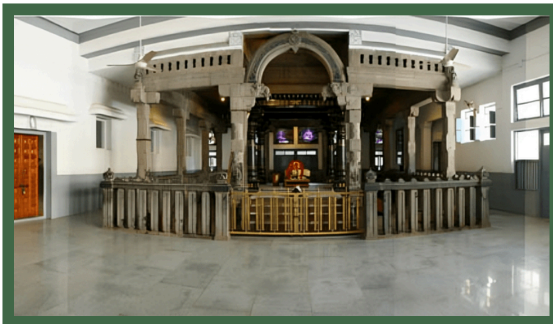
Bhagavan's Samadhi Shrine at Sri Ramanasramam